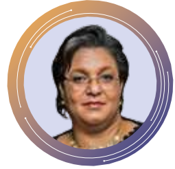
Hanna S. Tetteh Director General, UN Offices, Nairobi

Ms. Hanna S. Tetteh is the Director-General of the United Nations Office at Nairobi (UNON). Ms Tetteh most recently served in the cabinet of the Government of Ghana as Minister for Foreign Affairs (January 2013-January 2017), and Minister for Trade and Industry (February 2009-January 2013). Ms. Tetteh is a practising Lawyer and holds a Bachelor of Laws (LLB) degree from the University of Ghana, Legon. She also completed her professional law course at the Ghana School of Law, and was called to the Ghana Bar in October 1992.