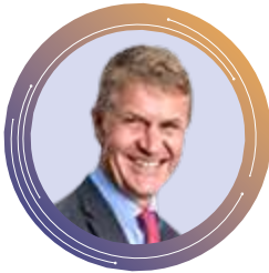
Erik Solheim Executive Director, UN Environment

Erik is the Executive Director of UN Environment since 2016, with an extensive career focusing on environment and development. Prior to his appointment, Solheim served as chair of the Development Assistance Committee of the Organization for Economic Co-operation and Development. He has received a number of awards which include: UN Environment's Champions of the Earth award, TIME Magazine's Hero of the Environment, and a honorary doctorate from TERI University in India. He is the author of three books.